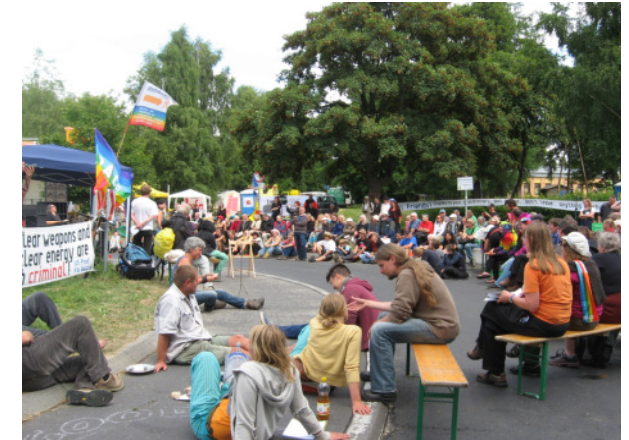
Nonviolent blockade of nuclear missiles in Büchel 2013.

Furthermore we are active in adult education with publications or events about our topics.