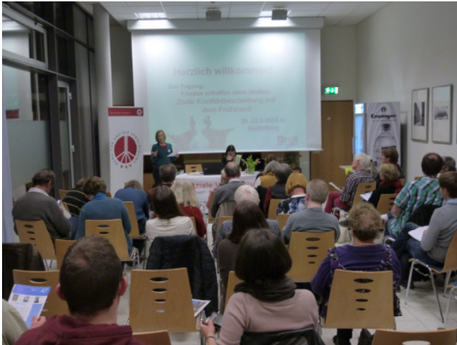
Annual conference of BSV 2015 in Heidelberg, discussing conflict transformation.

The Federation for Social Defence (German: “Bund für Soziale Verteidigung”, BSV) is an independent non-governmental organization based in Germany. The BSV stands for the development of peaceful alternatives to war, armed violence and the military. Our objective is to create a global community without war or violence, with social, political, ecological and economic justice. Conflicts should be solved nonviolently, without military means.